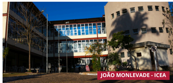
JOÃO MONLEVADE - ICEA